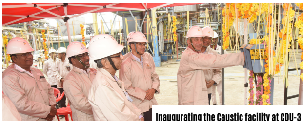
Inaugurating the Caustic facility at CDU-3