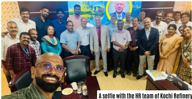
A selfie with the HR team of Kochi Refinery