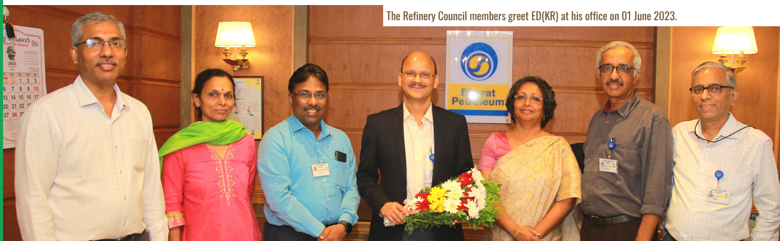
The Refinery Council members greet ED(KR) at his office on 01 June 2023.