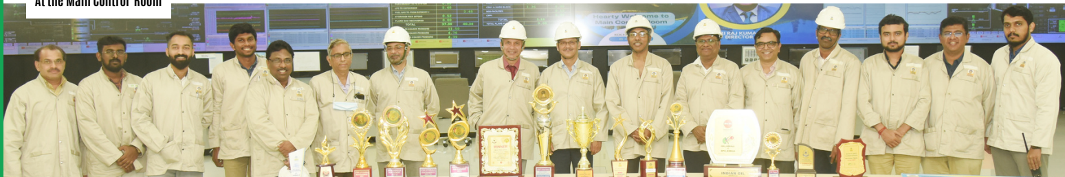
At the Main Control Room