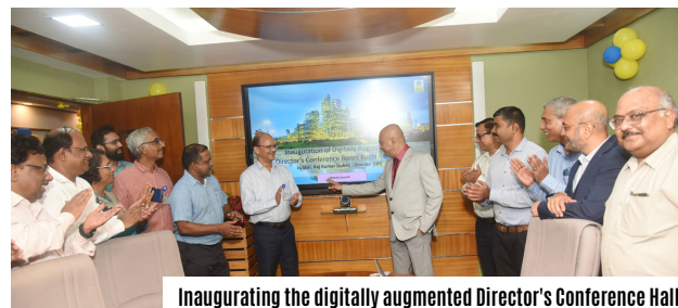
Inaugurating the digitally augmented Director's Conference Hall