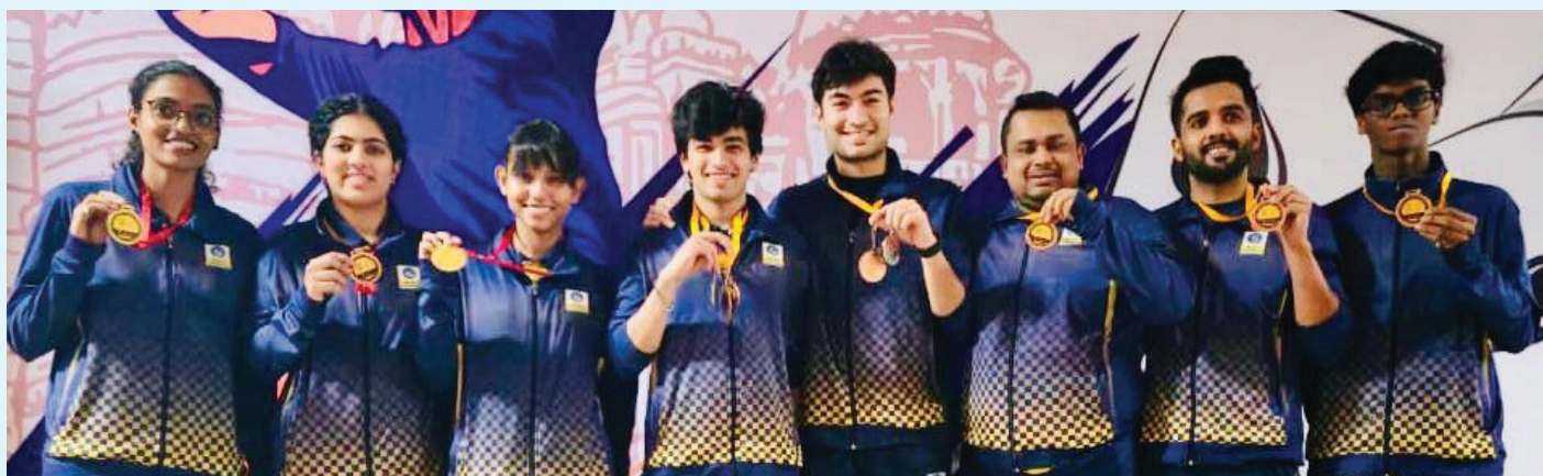
BPCL winning Table Tennis Team