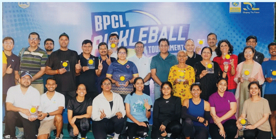
Winners of BPCL Pickleball Tournament