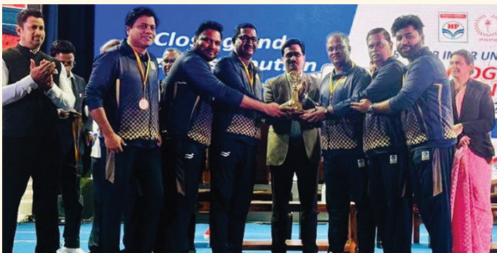
BPCL receiving 2nd runner up trophy

Their success not only signals a strong return for BPCL on the national Bridge stage but also reinforces the organization's enduring culture of sporting excellence and teamwork.