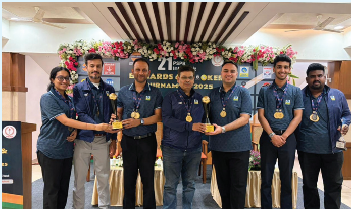
BPCL winning Billiards & Snooker Team