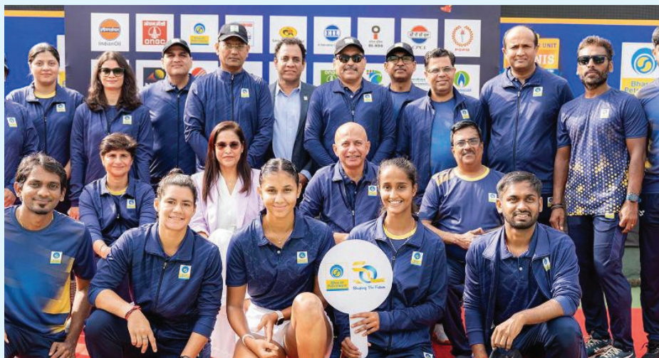
BPCL Tennis Team 2025-26