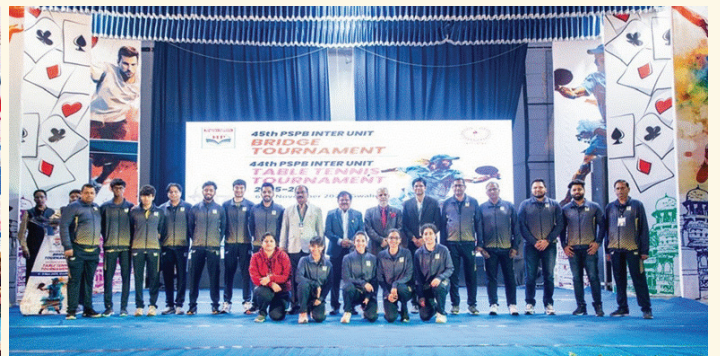
BPCL Bridge and Table Tennis Team