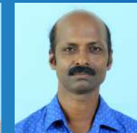
REJIMONE Y OM&S