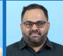
ANVAR SADATH V A / P&U