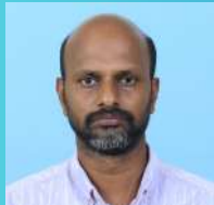
SAJEEV T P&U