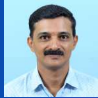
VINOD E K PETCHEM