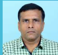
VINOD E OM&S