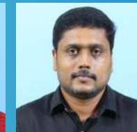
BINU D HSE