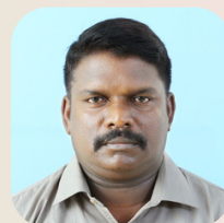
Shaibu CS OM&S