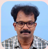
Bijumon CP Maint