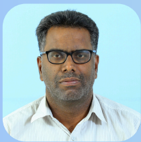
Dinesh T Mfg