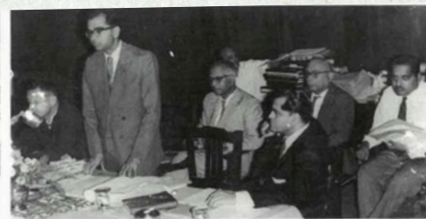
The first CRL Chairman addressing AGM