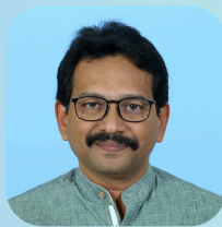
Cauma Paul Mfg