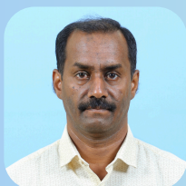
Biju TR Mfg