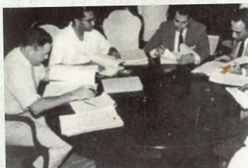
One of the initial Board Meetings

By 1960s, Philips was one of the most coveted multi-national companies. Based on the agreement, Cochin Refineries Limited (CRL) was formally registered on September 6, 1963 at Emakulam."