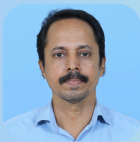
Nazeer VS Mfg