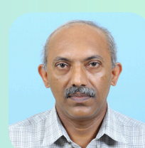
Sabu D Mfg