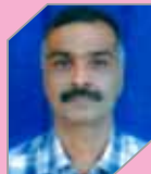
Jawale N S Tech - Process Engg