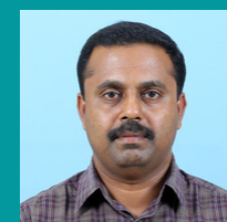
Aji MG Mfg