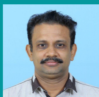
Sony George Mfg