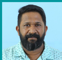
Siju KM Mfg