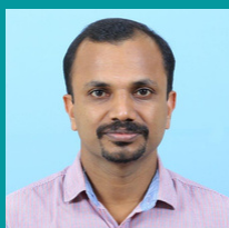
Pradosh AB QC