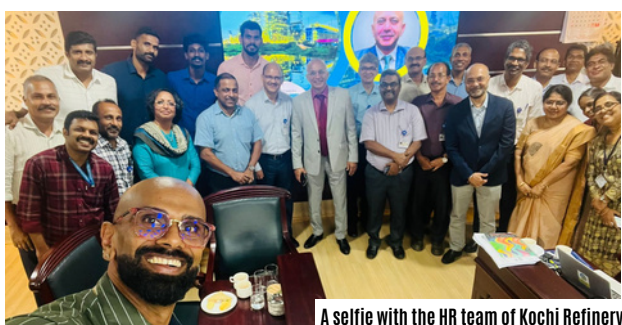
A selfie with the HR team of Kochi Refinery