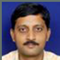
KUNDU B HSE -PSM