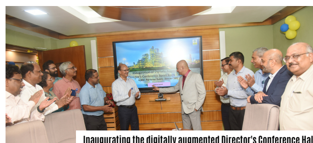
Inaugurating the digitally augmented Director's Conference Hall