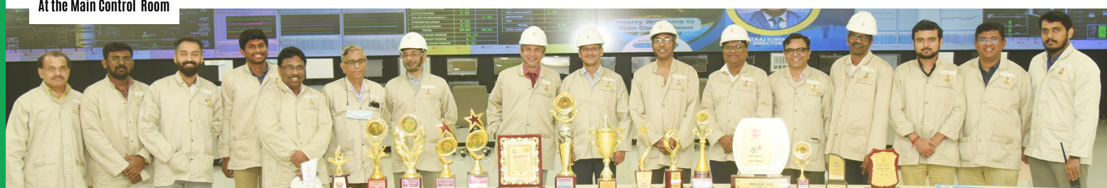
At the Main Control Room