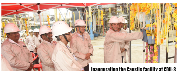
Inaugurating the Caustic facility at CDU-3