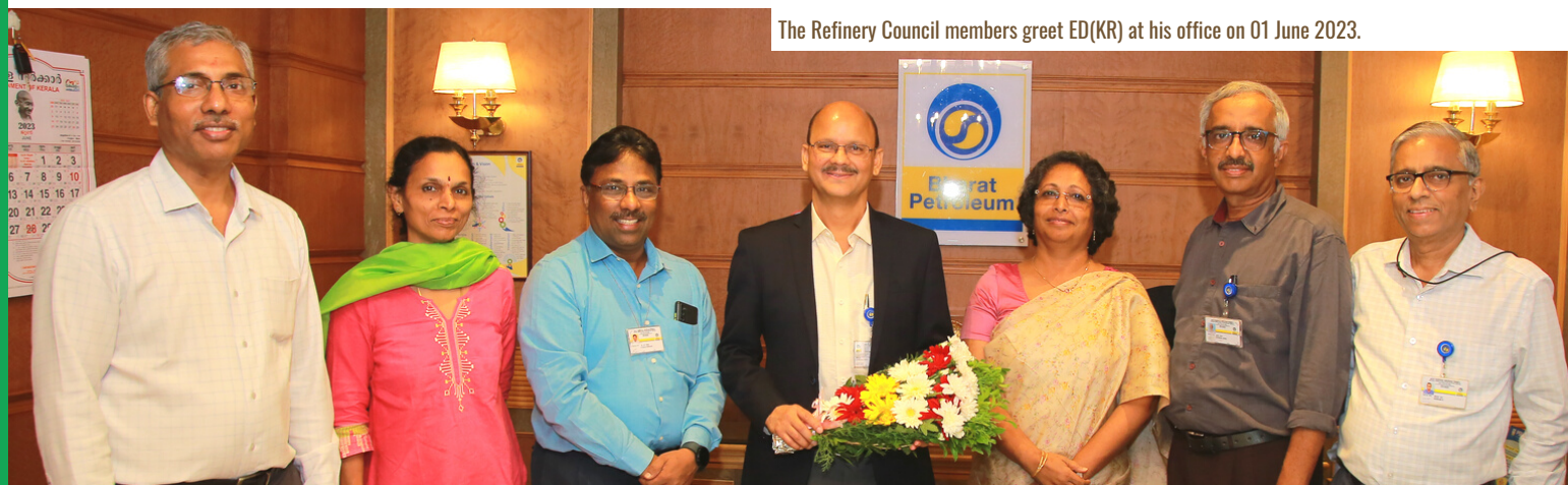
The Refinery Council members greet ED(KR) at his office on 01 June 2023.