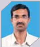
Achuthanandan C S P&U Utilities