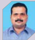
George Philip Fire & Safety